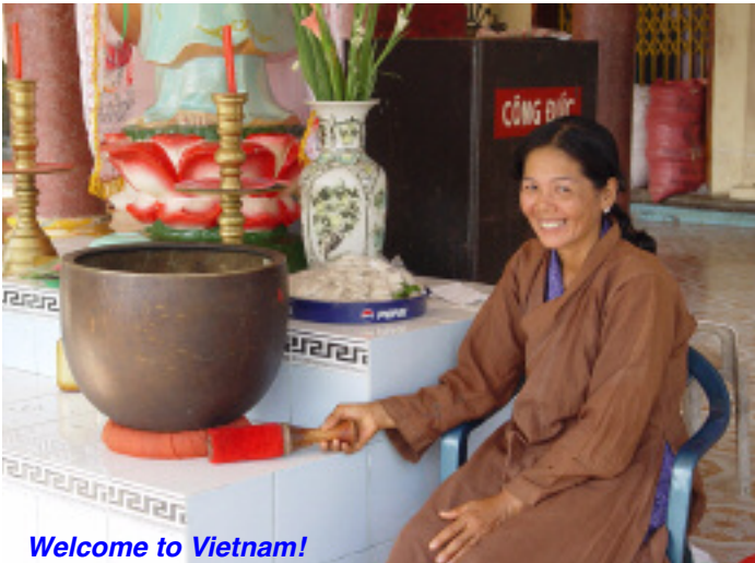
Welcome to Vietnam!

We offer our travelers an opportunity to tour areas in and around Saigon once called III Corps or the former Saigon Capital Area . The tour is offered on your dates from January through April or October through December. We don't recommend travel during the wet season (May through September, but we can operate in these months if you have no other option).