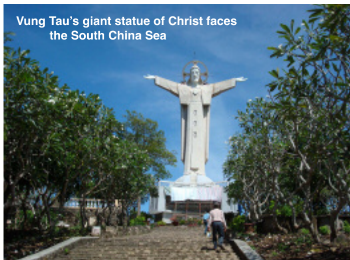
Vung Tau's giant statue of Christ faces the South China Sea