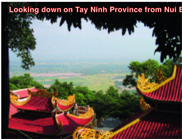
Looking down on Tay Ninh Province from Nui Ba Den