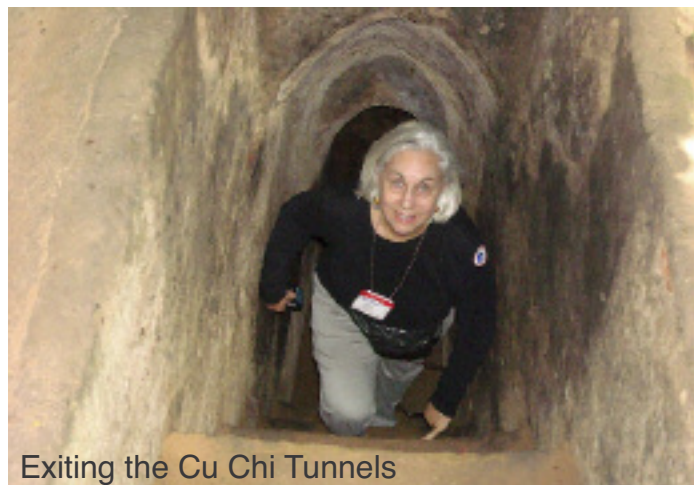
Exiting the Cu Chi Tunnels